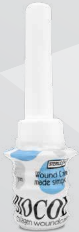
BIOCOL™ collagen powder