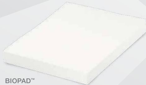
BIOPAD™ collagen dressing