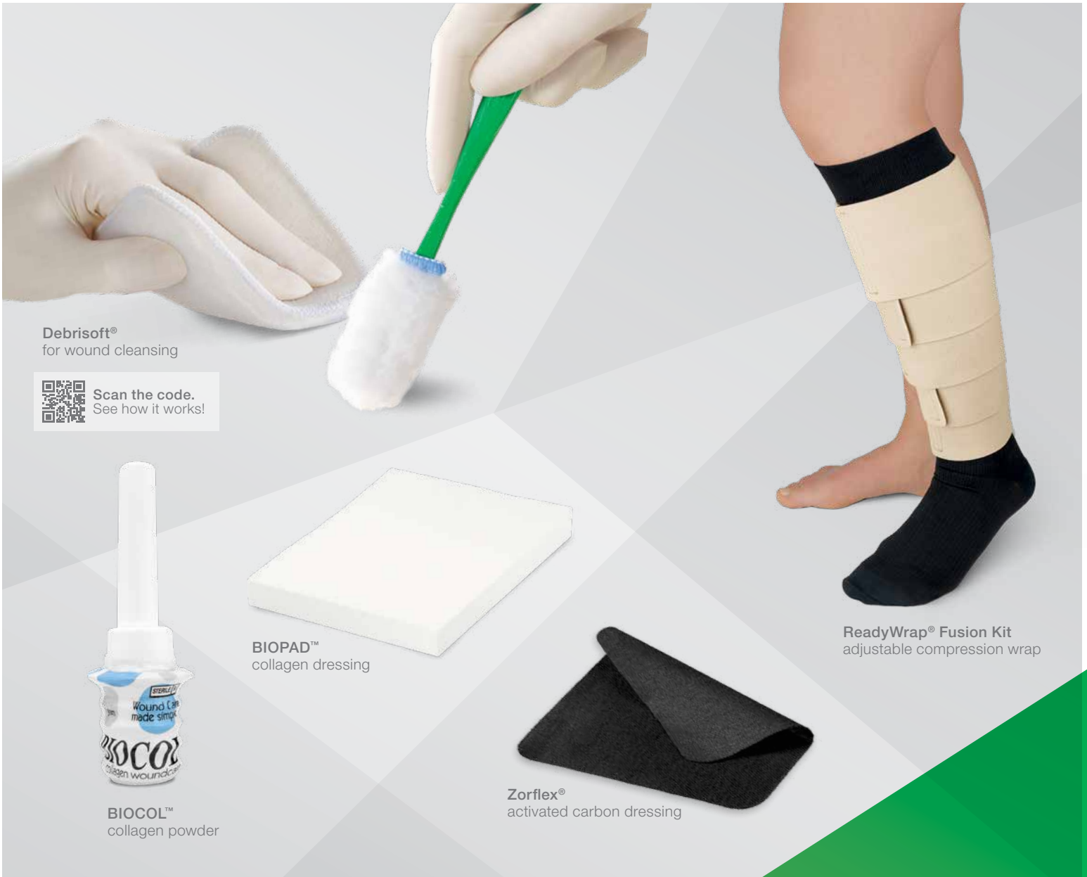
Debrisoft® for wound cleansing