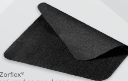
Zorflex® activated carbon dressing