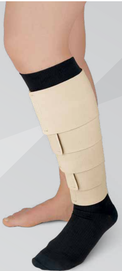
ReadyWrap® Fusion Kit adjustable compression wrap